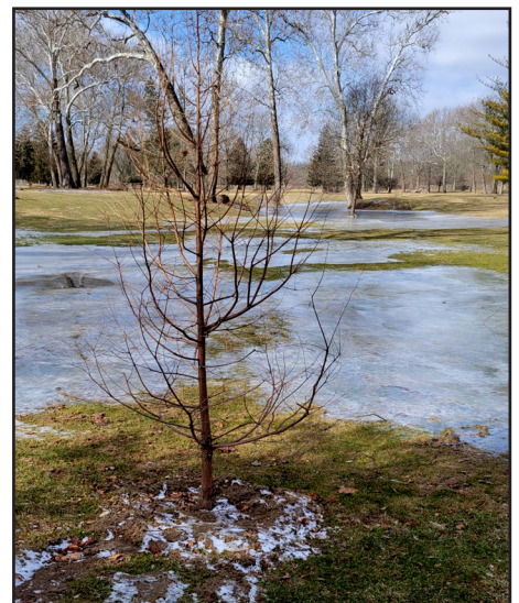
New Taxodium distichum, bald cypress tree planted in early 2022.