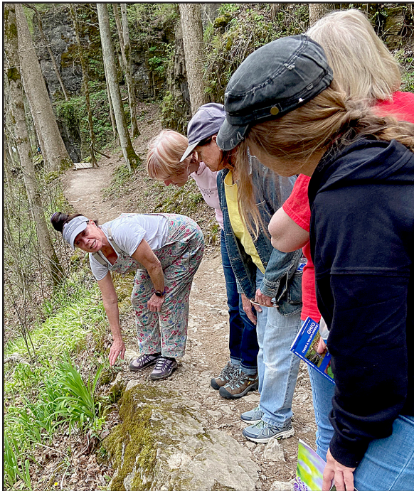
Wildflower Walk Clifton Gorge from 2023.