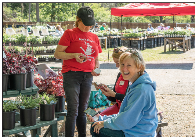
MGV Plant Sale May 2023.