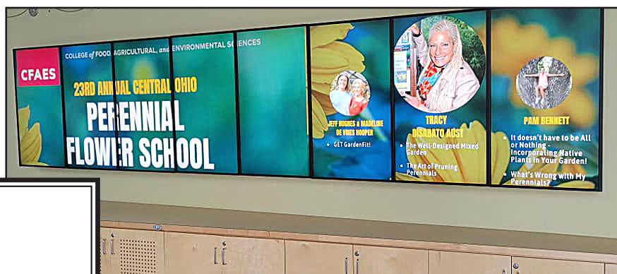
Last year's Central Ohio Perennial School. Flyer for 2024 Perennial School on pg. 10.

Garden of Eatin' Workday Friday March March 22nd. 9 am to 11 am.