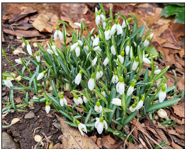
Early spring snow drops.