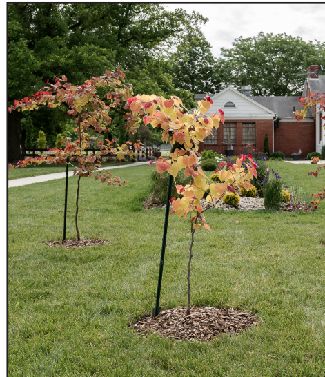
New Flame Thrower Redbud trees.