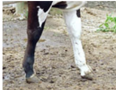
Not Holstein breed standard