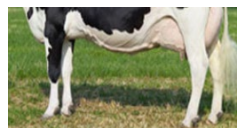
Holstein Breed standard