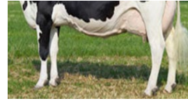
Holstein Breed standard